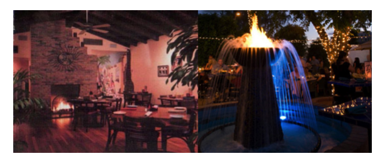
This Evening: Restaurant: Old Town Tortilla Factory

Ole' Ole'! On the outskirts of downtown Scottsdale is nestled one of the original restaurants of the city. Built from an historic 75-year old Scottsdale adobe home, Old Town Tortilla Factory captures timeless charm and distinct atmosphere that exemplifies the essence of the Southwest. The guests will feel at home surrounded by lush vegetation, old pecan trees, and the traditional flagstone flooring. The menu items are inspired by Native American and Sonoran cultures combined with authentic and fresh ingredients. Try the chorizo fundido or the red chili-crusted pork chops for dinner. To wash is all down try one of the 80 premium tequilas!